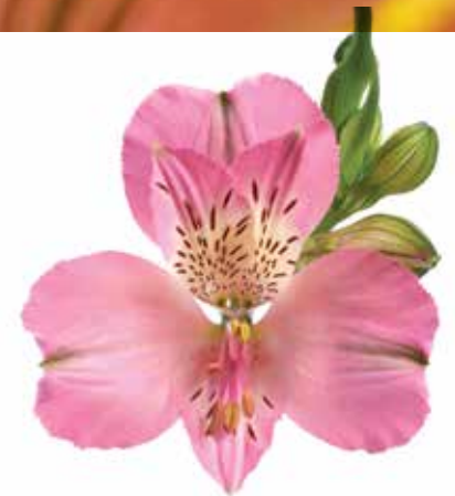
TOURMALINE™ | ZALSATOUR

colour: Pink flowers/stem: 5-6 flower size: extra large stem quality: normal production: high temp. tolerance: normal virus tolerance: low