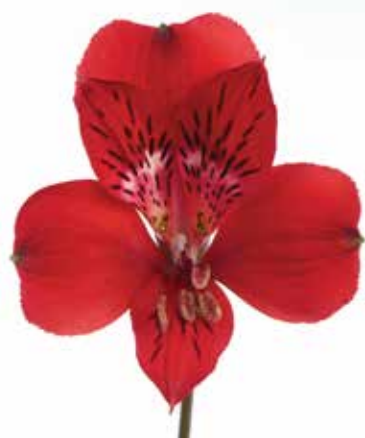
RED DELIGHT™ | ZALSAREDI

colour: Red flowers/stem: 5-6 flower size: normal stem quality: normal production: normal temp. tolerance: normal virus tolerance: normal