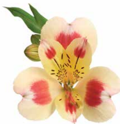
SYLVAN™ | ZALSASYL

colour: Yellow flowers/stem: 5-6 flower size: large stem quality: high production: very high temp. tolerance: very high virus tolerance: very high