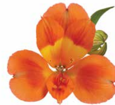
DANCING QUEEN™ | ZALSANCE

colour: Orange flowers/stem: 5-6 flower size: extra large stem quality: normal production: normal temp. tolerance: high virus tolerance: high