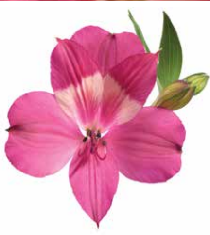
INTENZ PINK™ | ZALSATENZ

colour: Pink flowers/stem: 5-8 flower size: large stem quality: normal production: high temp. tolerance: very high virus tolerance: very high