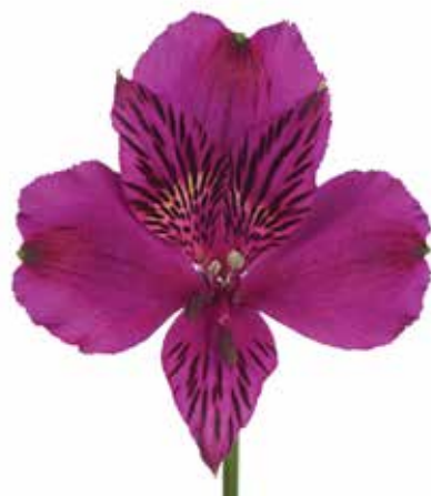
AMATISTA™ | ZALSATISTA

colour: Purple flowers/stem: 5-6 flower size: large stem quality: high production: high temp. tolerance: normal virus tolerance: low