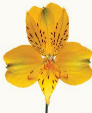
SENNA™ | ZALSASENAN

colour: Yellow flowers/stem: 5-6 flower size: large stem quality: normal production: normal temp. tolerance: normal virus tolerance: normal