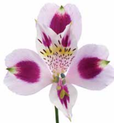
MAYFAIR™ | ZALSAMAY

colour: Bicolour flowers/stem: 5-6 flower size: large stem quality: normal production: high temp. tolerance: high virus tolerance: normal