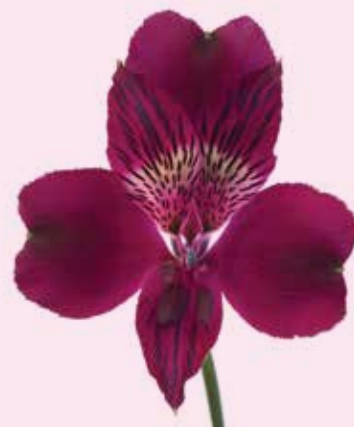
ONYX™ | ZALSANYX

colour: Purple flowers/stem: 5-6 flower size: large stem quality: high production: high temp. tolerance: normal virus tolerance: low