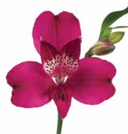
HELENA™ | ZANALSHELEN

colour: Purple flowers/stem: 5-6 flower size: large stem quality: normal production: normal temp. tolerance: very high virus tolerance: normal