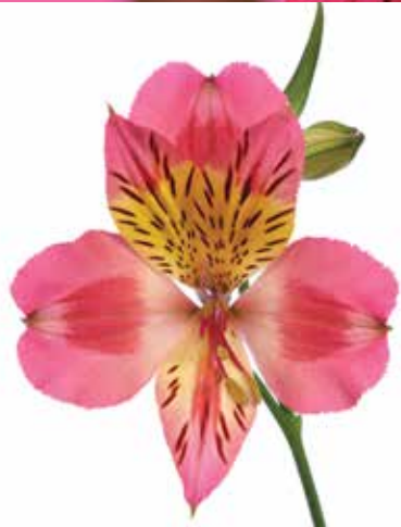
ALYNA™ | ZALSALYNA

colour: Pink flowers/stem: 5-8 flower size: large stem quality: normal production: high temp. tolerance: very high virus tolerance: very high