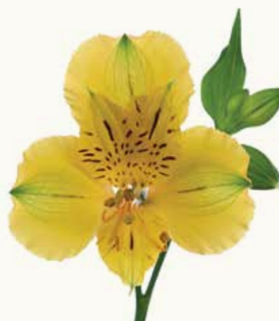
LEMON™ | ZALSAMON

colour: Bicolour flowers/stem: 5-7 flower size: large stem quality: normal production: high temp. tolerance: very high virus tolerance: high