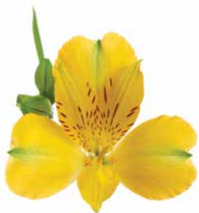
SUNNY LADY™ | ZALSASULA NEW 2018

colour: Yellow flowers/stem: 5-6 flower size: large stem quality: normal production: normal temp. tolerance: normal virus tolerance: normal