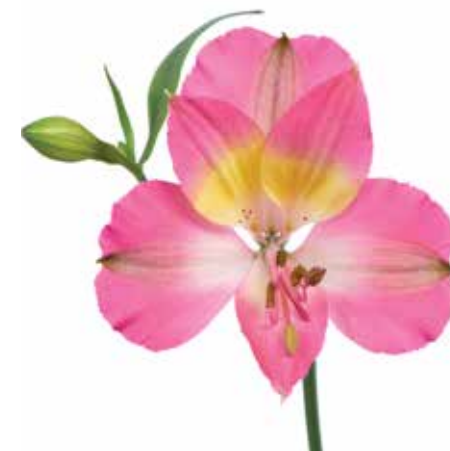
POEM™ | ZALSAPOEM