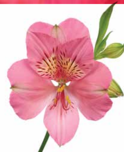
PINKWELL™ | ZALSAPINK