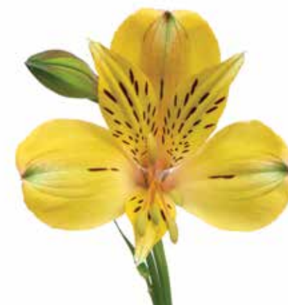
SOLANGE™ | ZALSASOL

colour: Yellow flowers/stem: 5-6 flower size: normal stem quality: normal production: high temp. tolerance: very high virus tolerance: very high