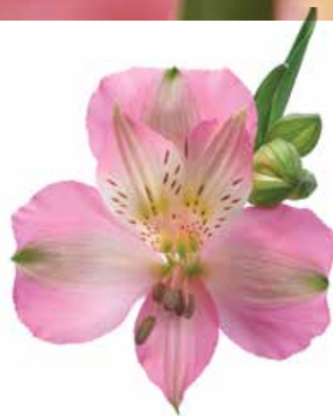
POSH PINK™ | ZALSAPOSH

colour: Pink flowers/stem: 5-6 flower size: extra large stem quality: normal production: high temp. tolerance: normal virus tolerance: low