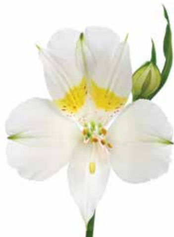
ICECUP™ | ZALSACUP