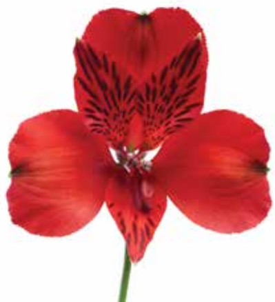
NADYA™ | ZALSANAO

colour: Red flowers/stem: 5-6 flower size: normal stem quality: normal production: normal temp. tolerance: normal virus tolerance: normal