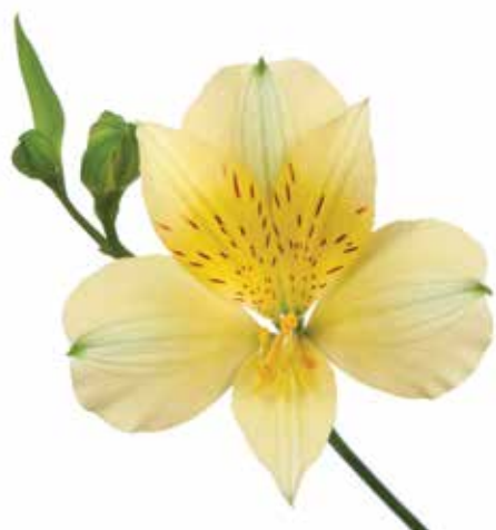
AZORA™ | ZALSAZORA

colour: Yellow flowers/stem: 5-6 flower size: large stem quality: high production: very high temp. tolerance: very high virus tolerance: very high