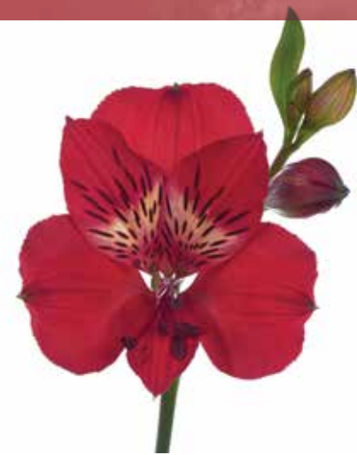
RED BARON™ | ZALSABARON

colour: Red flowers/stem: 5-6 flower size: normal stem quality: normal production: high temp. tolerance: high virus tolerance: very high