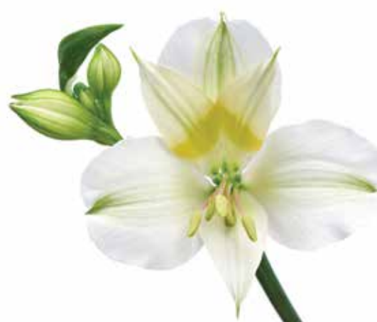
ICE CREAM™ | ZALICE