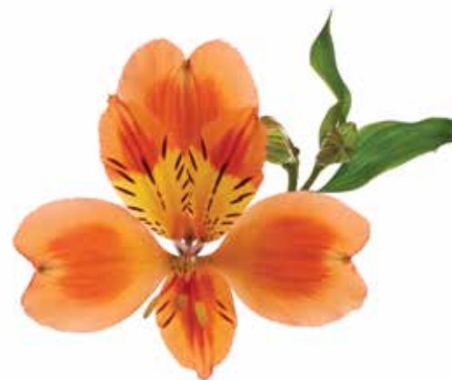
ORANGE QUEEN™ | STAQUEEN

colour: Yellow flowers/stem: 5-6 flower size: normal stem quality: normal production: very high temp. tolerance: very high virus tolerance: high