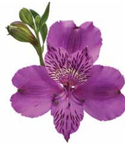
AARON™ | ZANALSRON

colour: Bicolour flowers/stem: 5-6 flower size: large stem quality: normal production: high temp. tolerance: high virus tolerance: normal