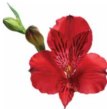
NATALYA™ | ZALSATAL

colour: Red flowers/stem: 5-7 flower size: large stem quality: high production: high temp. tolerance: high virus tolerance: low