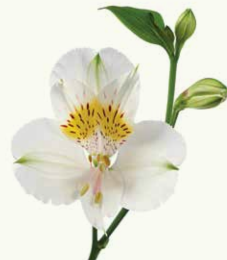
AVALANGE™ | ZALSALAN